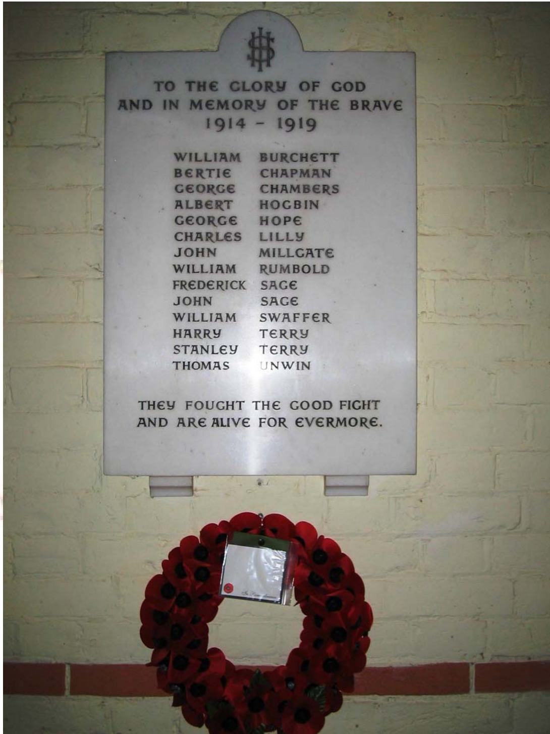
The Great War 1914 – 1919