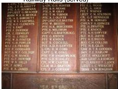
Ashford St Mary's Church