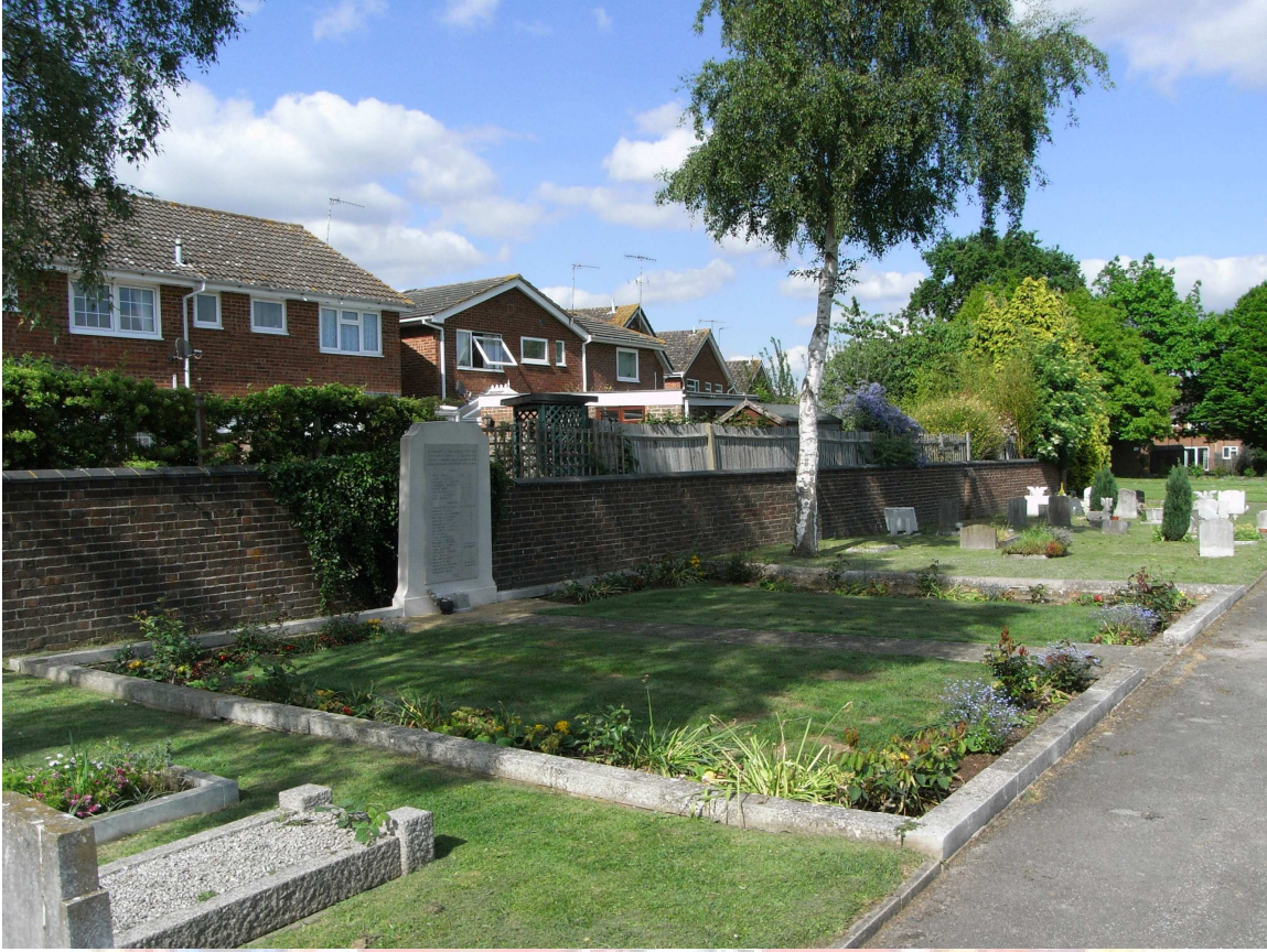
The Weald House Memorial with kerbed lawn and garden, in the churchyard of the parish church of St. Peter and St. Paul Edenbridge, Sevenoaks, Kent.