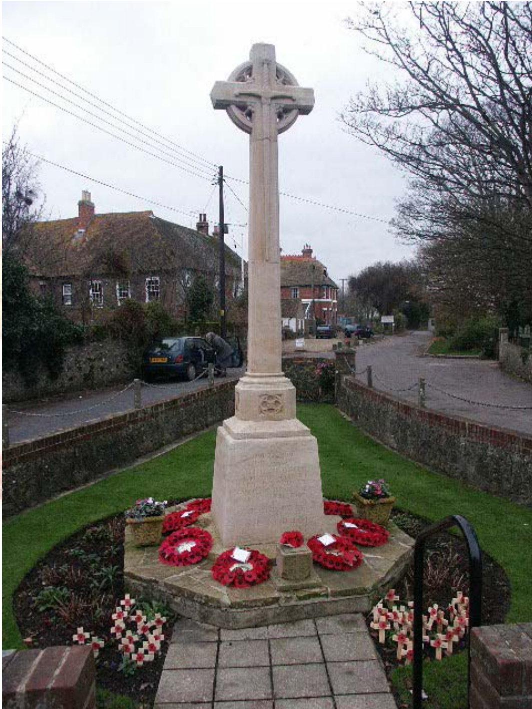
The Great War 1914 -1919