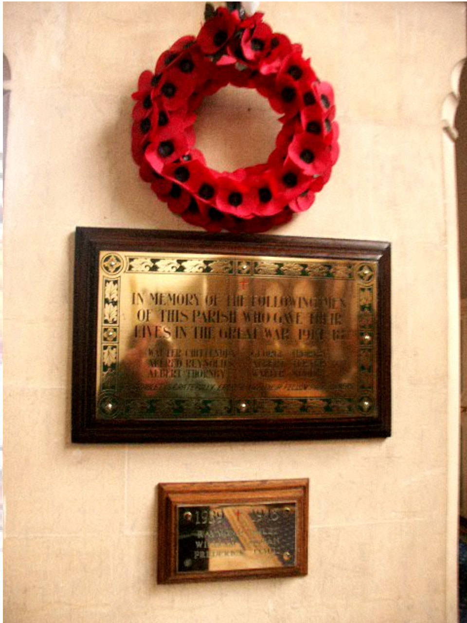
Church of St Lawrence