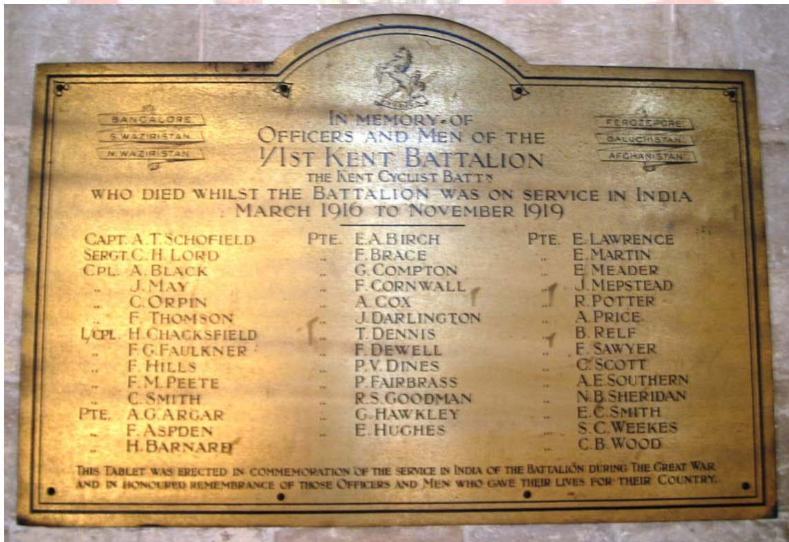
1/1st Kent Cyclist Battalion Memorial Plaque Canterbury Cathedral