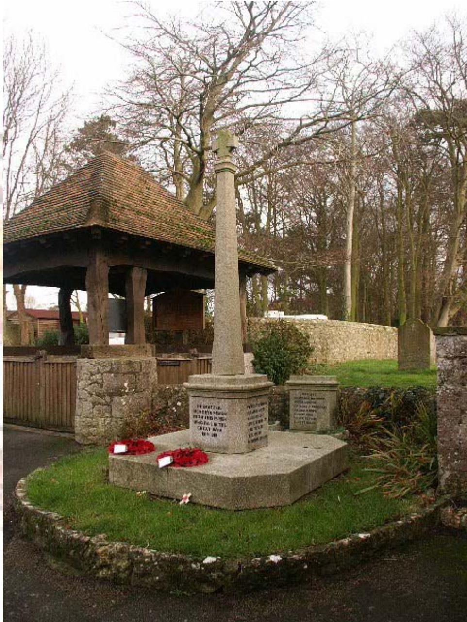
The Great War 1914 -1919